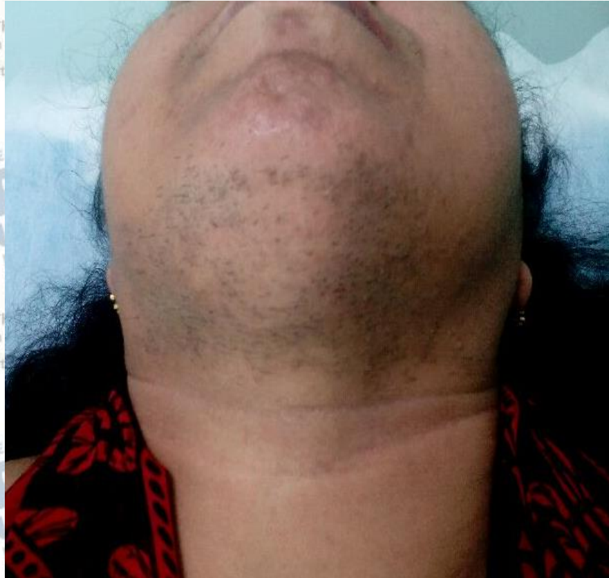
Before laser hair reduction