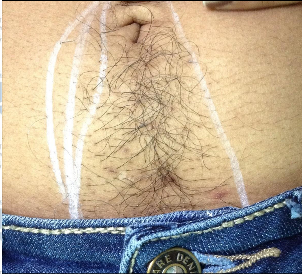
After 4 sessions